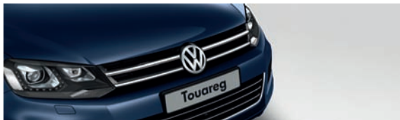
Night blue metallic