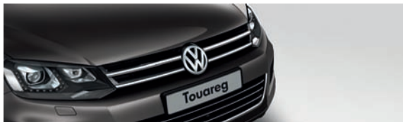
Galapagos anthracite metallic