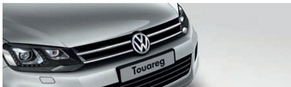
Cool silver metallic