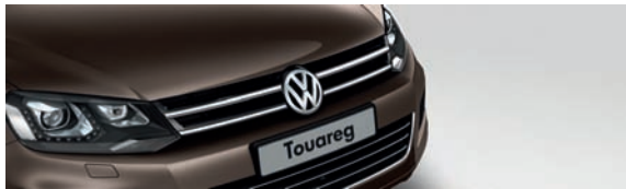
Graciosa brown metallic