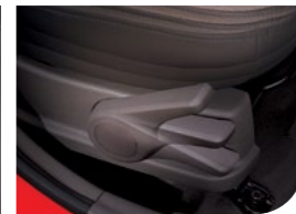
Driver Seat Height Adjuster

The Next Gen i10 is simply irresistible and speaks about class and innovation from every angle you look at it. The first-in-class turn indicators on the outside mirrors with heated function, the electric adjustable mirrors and electric sunroof lend a touch of luxury to this Next Gen phenomenon. While the automatic transmission ensures hassle free drive, the bluetooth connectivity, steering wheel remote, USB port and driver seat height adjuster make the drive convenient, providing the ultimate driving pleasure.