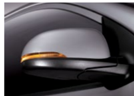
Outside Mirror Turn Indicators