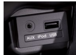
Aux and USB Ports