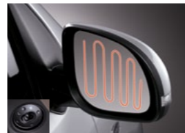
Electric Heated and Adjustable Outside Mirror