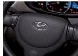
Steering Audio and Bluetooth Control