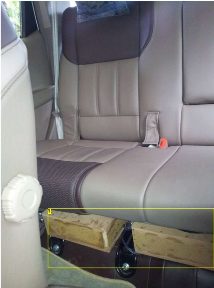
Image Notes 1. Our Final Aim