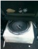
Acrylic Subwoofer Enclosure for under a car