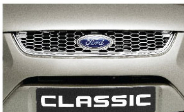
Front Chrome Grille