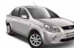
Moon Dust Silver